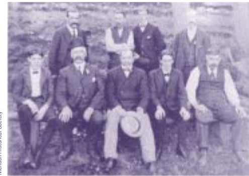
Mendon Historical Society

Mendon's Unitarian Church for a decade before he and 44 followers withdrew from town to begin their great experiment in Practical Christian communal living. From this house he published his weekly newsletter, the Independent Messenger , from 1831 to 1842.