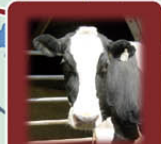
Wrights Dairy Farm & Bakery