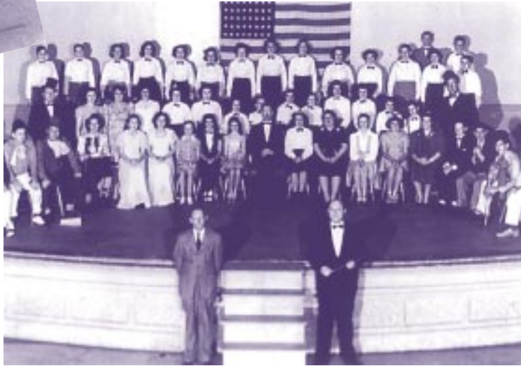
Clubs and social activities have formed an important part of Upton's heritage.