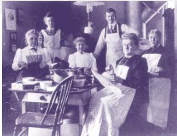
Historically, Upton has had two-wage-earner families, as women found ready employment in the hat business.

The church made news of another sort in 1970, when it combined with the Methodist Church to form the United Parish Church.